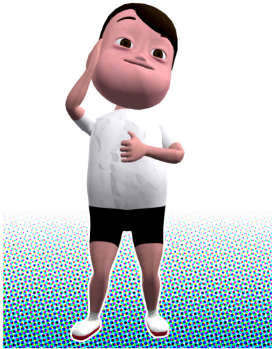
Figure 5: Pointing movement by the character