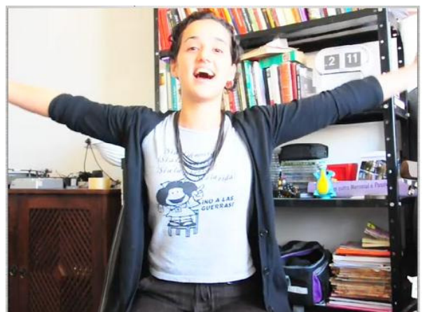
Figure 1: Illustration of an open arms movement.

Imitation has a fundamental relation with language acquisition [Schopler Et Al, 1990]. Learning words is part of the language acquisition and imitation helps in this process. Motor imitation must be learned before the language stimulation [Brandao, 2006]. Imitation also plays an important role in socialization, because through it a child learns how to behave, cooperate and respond [Brandao, 2006]. However, it is important to observe that the imitation capacity of children with Down syndrome is significantly lower than those without it [Guerrero López, 1997].