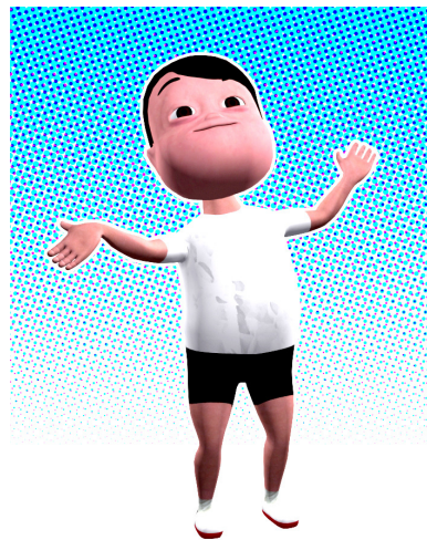
Figure 4: Open arms movement by the character

In this paper, we exposed some concepts of a game to stimulate children with DS. Our next steps are to conclude the development of the JECRIPE game, specially the movement recognition module mentioned in this text. Our goal is to offer an easy interaction for users with impairment, by recognizing broad gestures in front of a single camera. This kind of interaction may facilitate the interaction of this kind of user in comparison to a keyboard, mouse or gamepad.